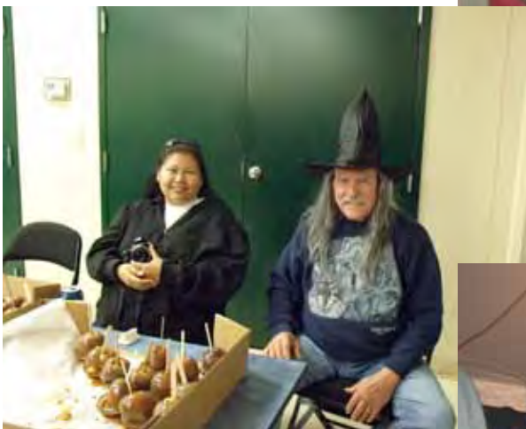
AST Fall Festival