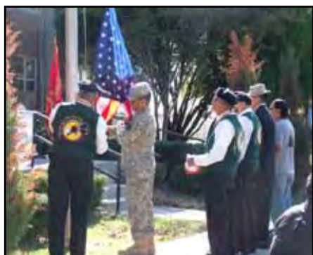
Raising the flags