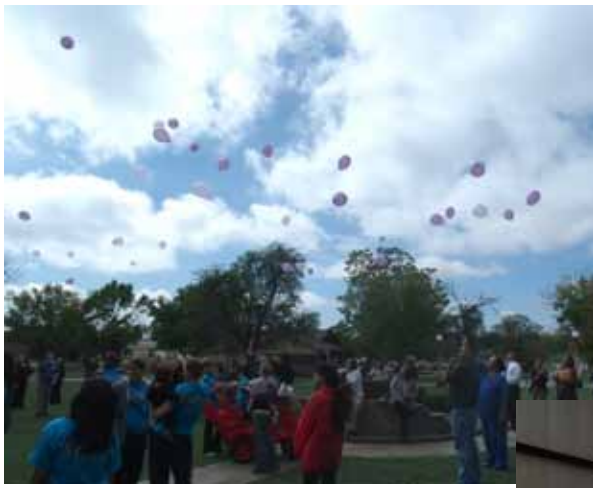
Domestic Violence October Ballon Release