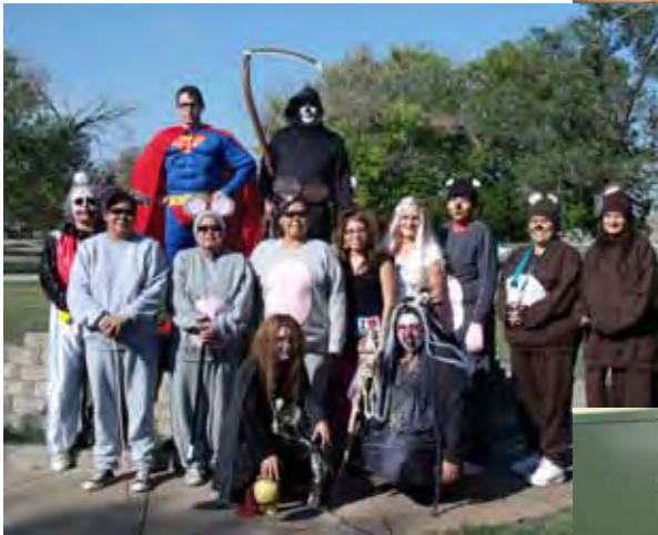
AST Employee Halloween Contest