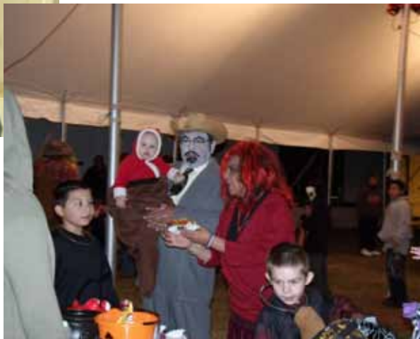
AST Fall Festival