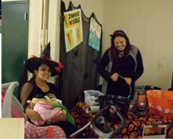
AST Fall Festival