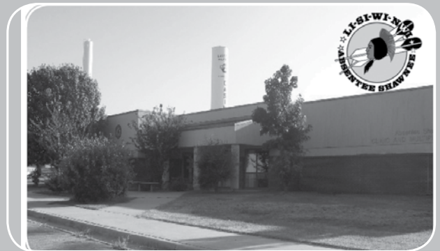
Absentee Shawnee Tribe of Oklahoma

Absentee Shawnee Tribe Complex Office of Environmental Health & Engineering, Building 13 If you have any questions, you can reach us by phone at (405) 214-4235