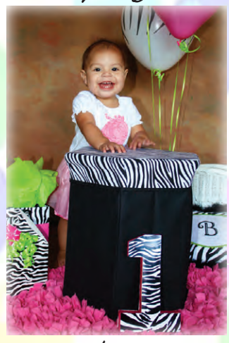
love, Momma and Daddy